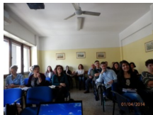
Welcome to Rome meeting