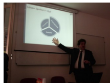
Meeting at Istituto Spelluci Center