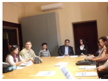
Telematic University UNINETTUNO