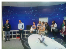
Istanbul Technical University