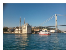
Visit to Istanbul